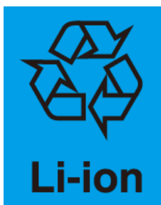
Colour: blue (Pantone 312)

In addition, the battery (or battery pack) shall be marked with an international recycling symbol as given in ISO 7000 (Graphical symbols for use on equipment) and specify the cell chemistry of the battery (e.g. Li-Ion, Ni-MH). This symbol shall be colour-coded in accordance with the recommendations of the Battery Association of Japan 15 or the draft IEC 62902 standard (Secondary batteries: Marking symbols for identification of their chemistry):